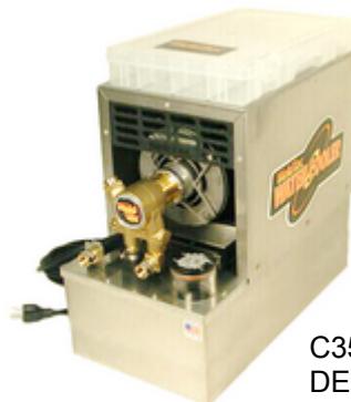
C35 DELUXE (3 Gallon)